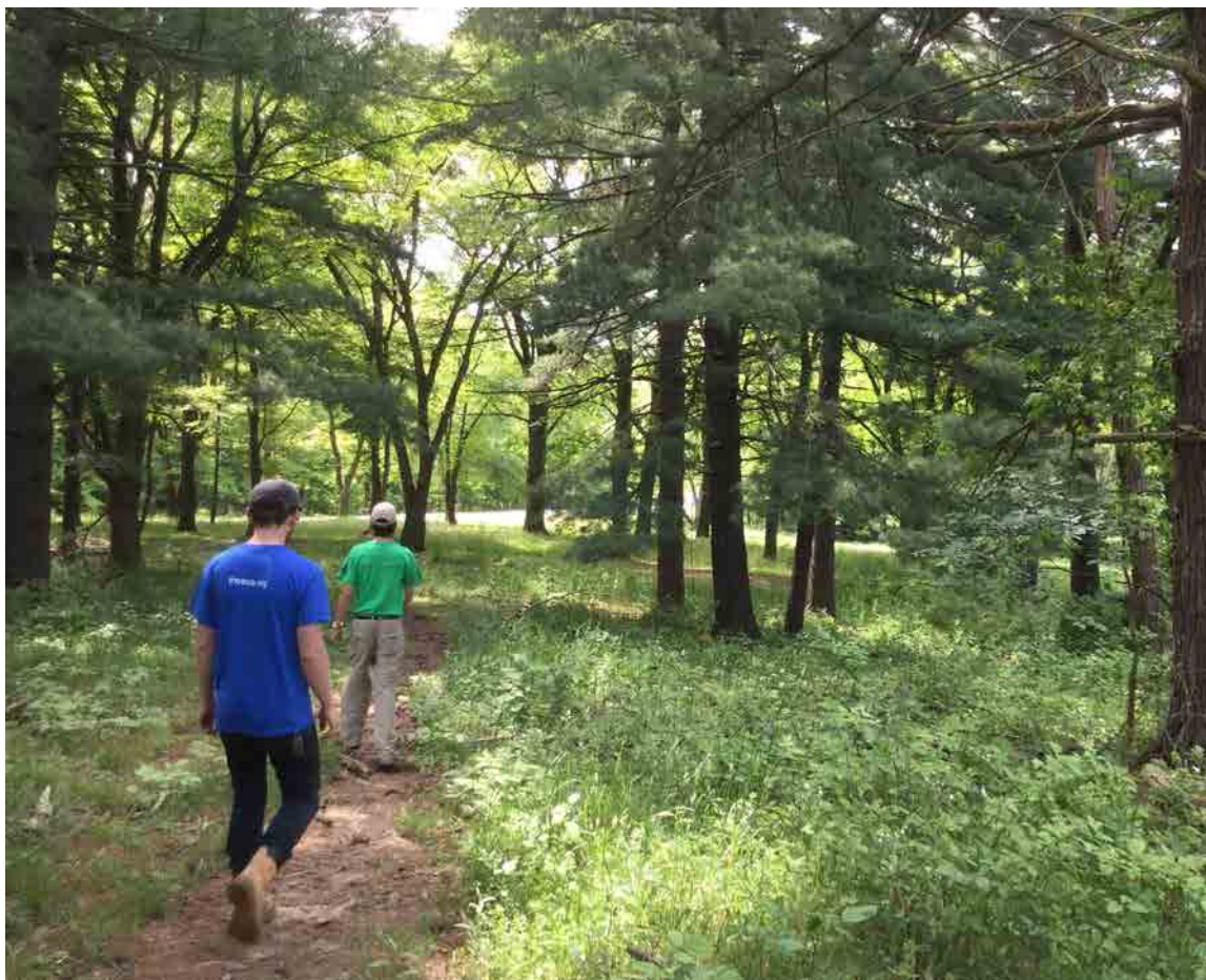
WPC staff walk the trails of South Park.

This report and accompanying set of maps, charts and resources is intended for use by the Allegheny Parks Foundation and the Allegheny Parks Department staff to protect and restore South Park's natural assets.