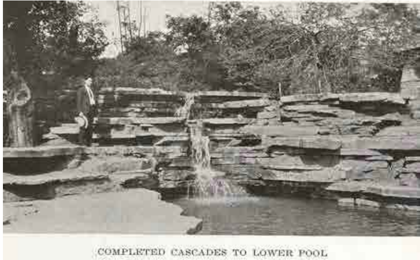
The South Park structure Lower Cascades after completion, part of Paul B. Riis’ structure using native materials.

were wooded; at least 150,000 trees were planted in the Park in its first four years. Riis also felt as though roads should be implemented only when necessary. He also believed that “native” materials be used whenever possible. This is why there were so many stone and wooden structures in the Park, many that still stand today. In the