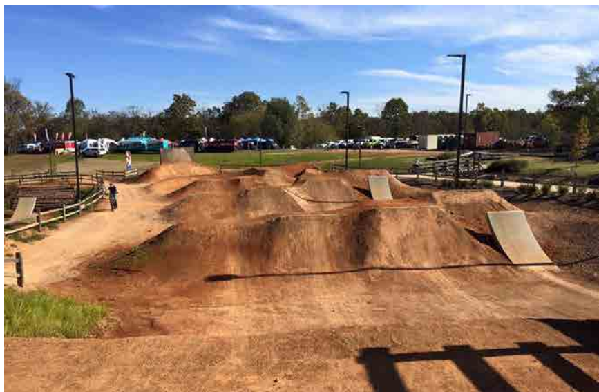
BMX track located in South Park.

Paul B. Riis, the first Allegheny County Parks Director, believed in combining scenic beauty with active recreation in a natural environment, when creating a park. He used “prairie style” ideas – conservation, restoration and repetition. Only 90 of the initial 1,400 acres of South Park