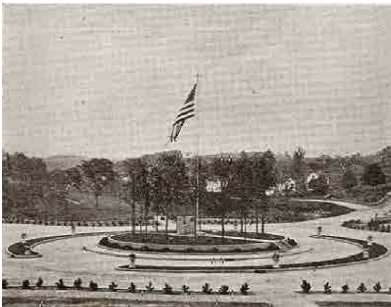
Historic photo of Kilmer Circle, part of the developments made to South Park with the county fair in the early 1930s.