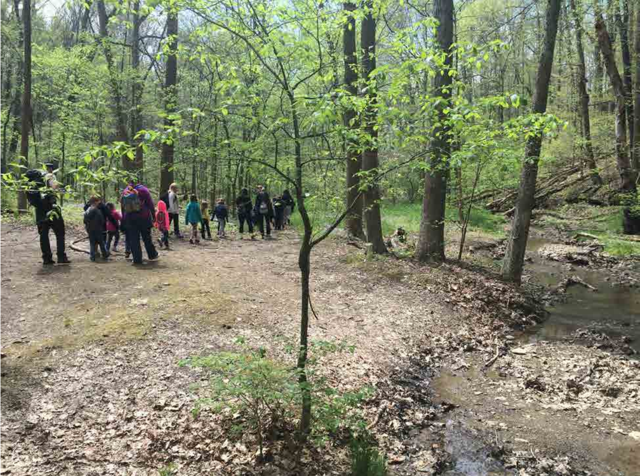
Allegheny Park rangers lead a class of school children through the Vale of Cashmere section of South Park.

The purpose of this project is to provide information on the current ecological conditions of South Park and present prioritized recommendations for